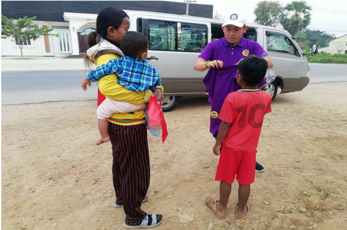
The volunteers shuttled the suspected CHD children to Phnom Penh hospital for diagnostic confirmation.