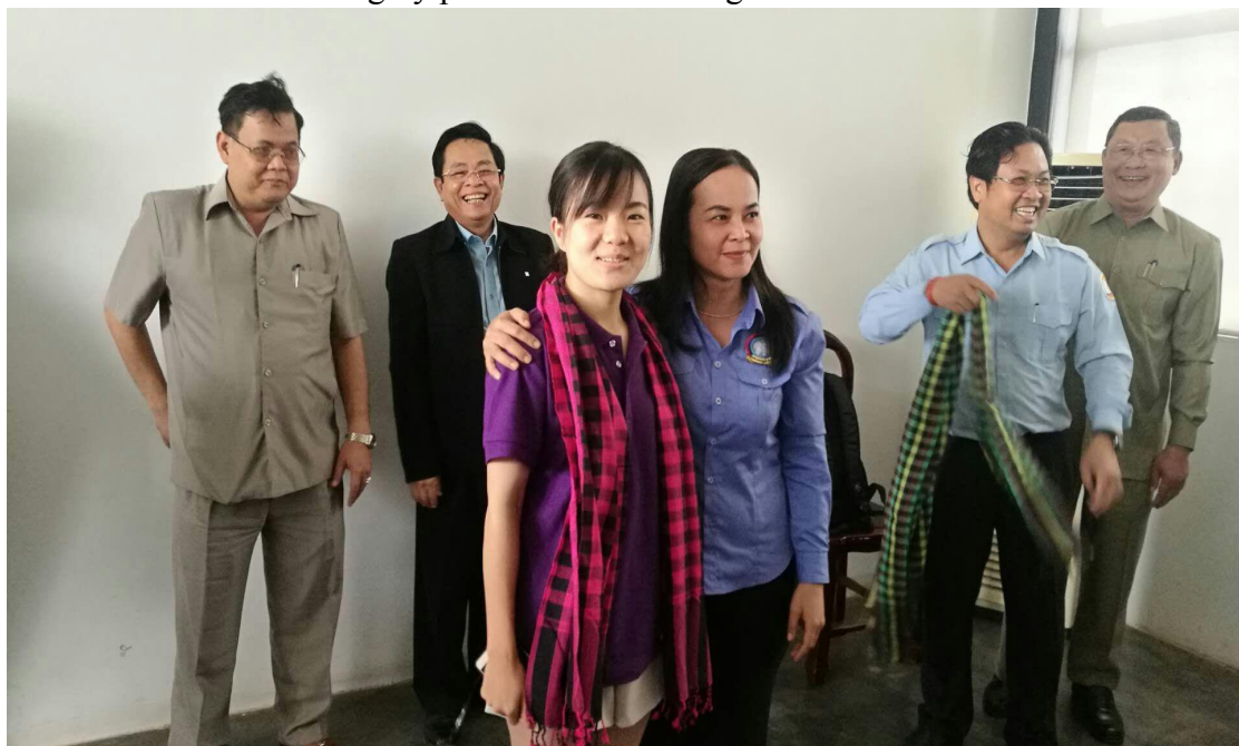
The governor and leaders of Battambang province also presented gift to two country's volunteers for gratitude.