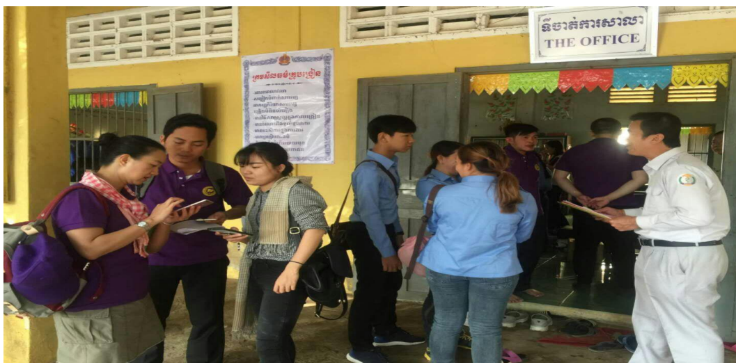
The Sino-Cambodia volunteers participated to prepare before schools screening.

The National leader of UYFC came to Battambang for field work coordination meeting, after help with free custom supervision of Chinese medical equipment through the Siem Reap airport in Cambodia.