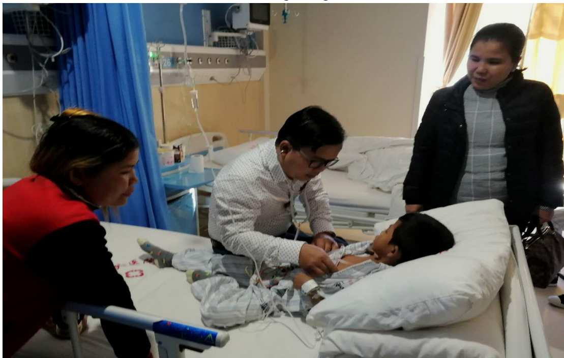
Cambodia voluntary doctor provided the exam at the ward and accepted Cambodia CHD post-operation followed up treatment