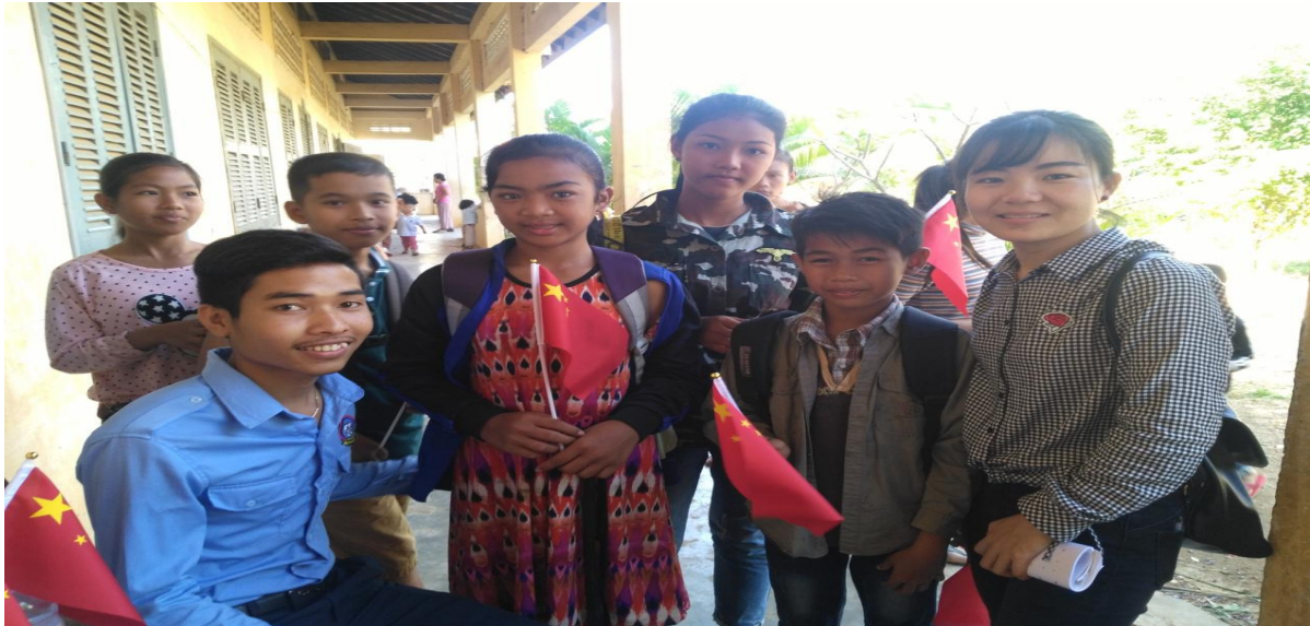
The volunteers jointly comforted the suspected CHD after the screening, helped to dispel misgivings of receiving medical services in China