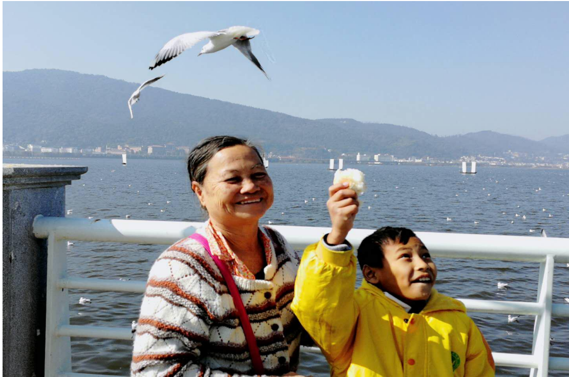
Two country social organization volunteers organized the entertainment activity for recovered Cambodia CHD children and family members to touch the Chinese culture and friendship.