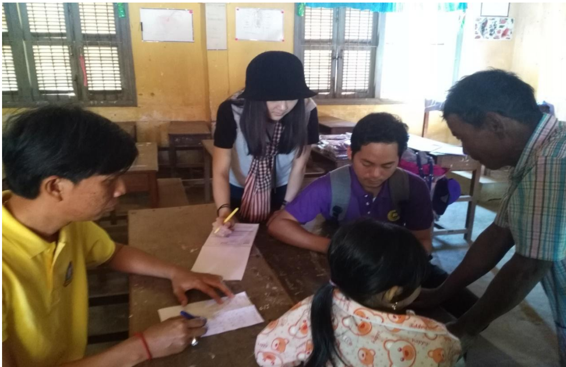
The Sino-Cambodia volunteers jointly collected screening project data and helped research related questionnaires.