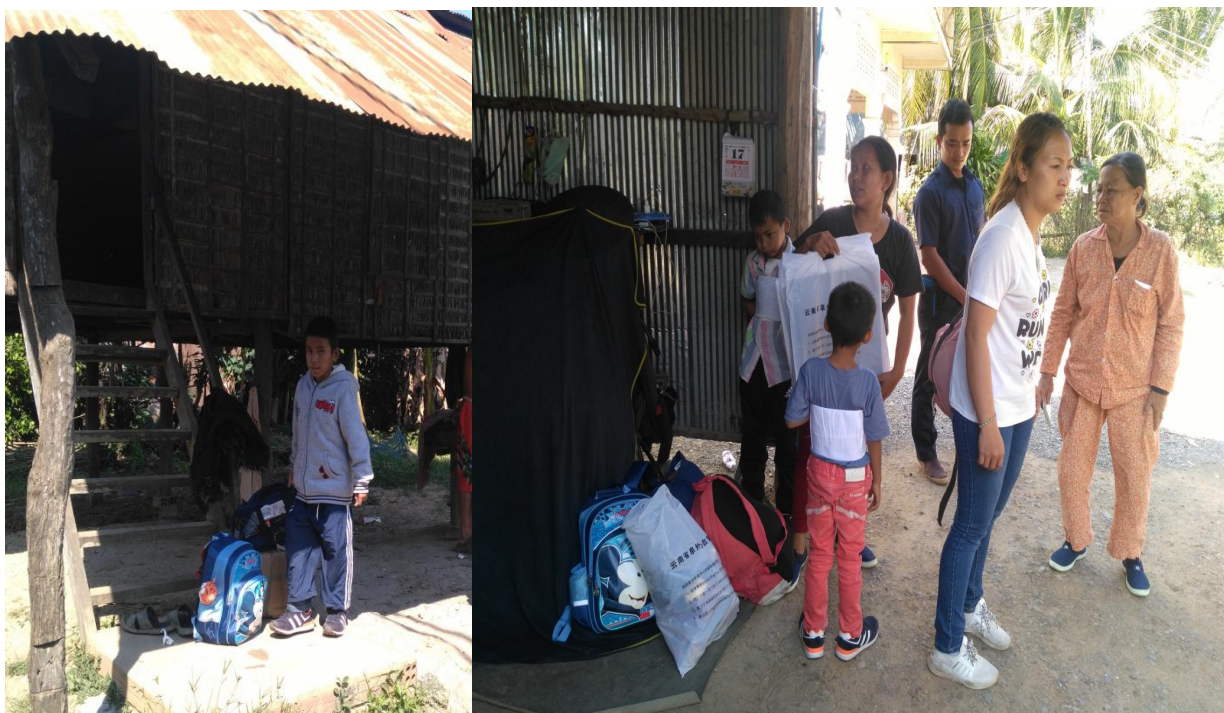
The social organizations of both sides planned education assistance, poverty relieving and community development for post operation impoverished CHD families