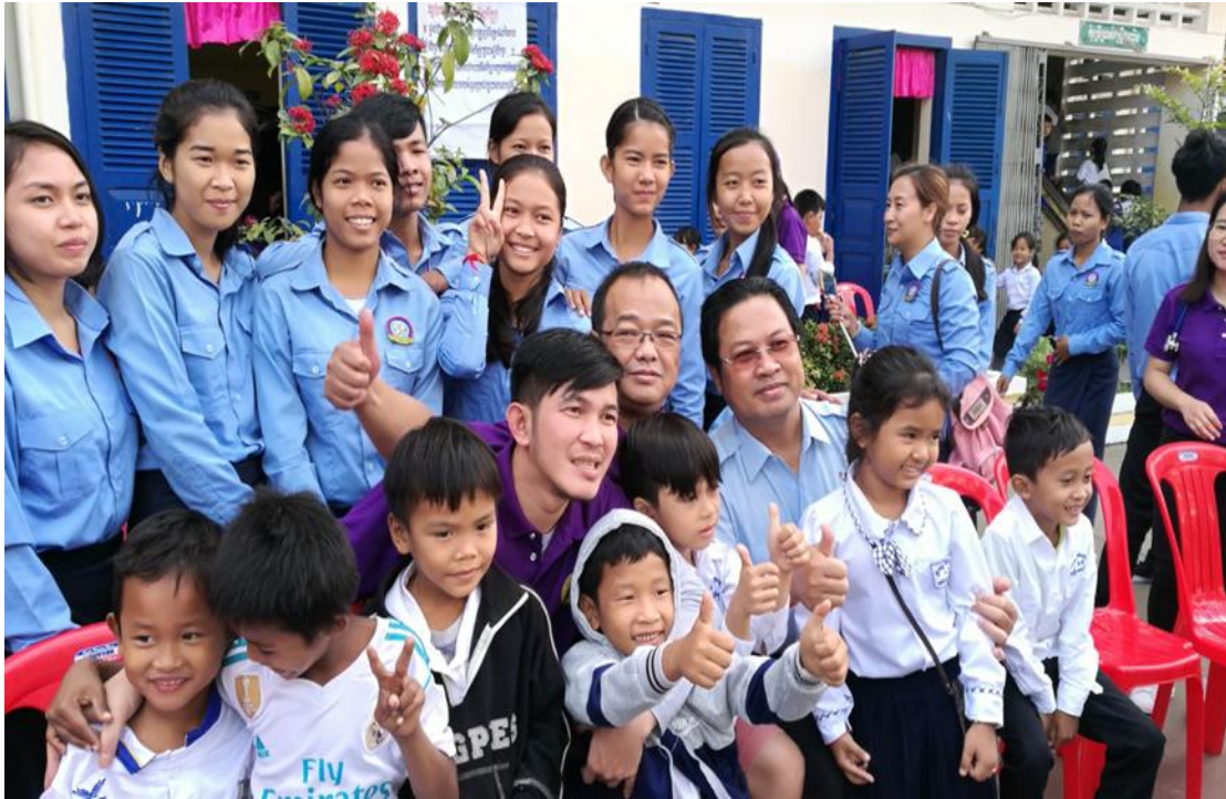
Volunteers from two countries shared the working and happy result with the Chinese and Cambodia doctors