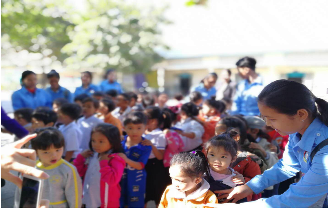
Volunteers organized children for screening.