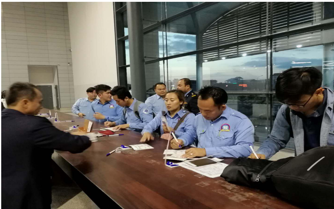
Before the departure, volunteers from two countries helped the first group of 7 CHD children and 7 family members' passports, visas application and accompanied trip to Kunming China. Besides, volunteers helped to get the medical document from Cambodia doctors timely and CHD family member's abroad treatment informed consent statement ready, which was essential to make the CHD treatment in China possible.