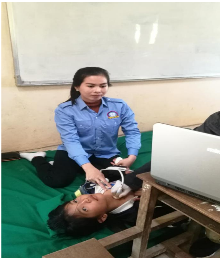
Youth Federation Cambodia (UYFC) volunteers always assisted ultrasound exam for whole project period.