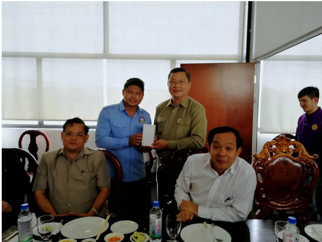
The Battambang provincial governor presented the distinguished prize to photograph competition final winner and highly praised the social organization's contribution.