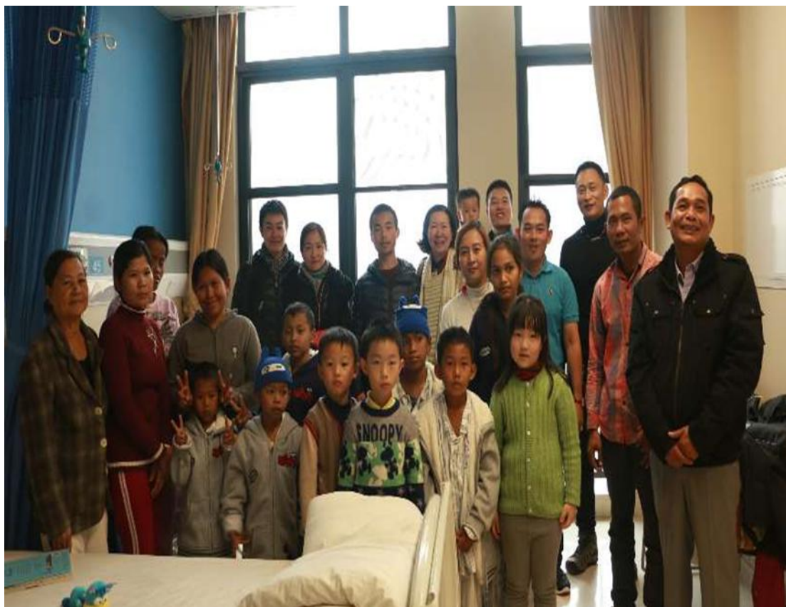
Social organizations organized Chinese children, Chinese CHD family member and Cambodia students to visiting the wards in the hospital.