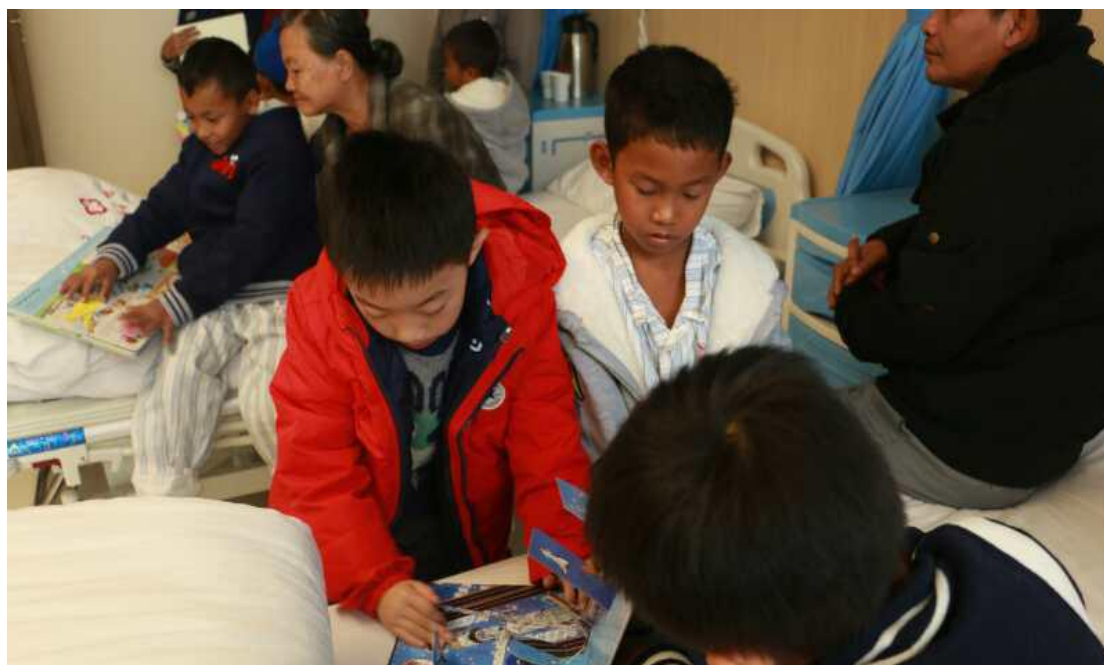
Chinese children played with the Cambodian CHD children at the hospital.