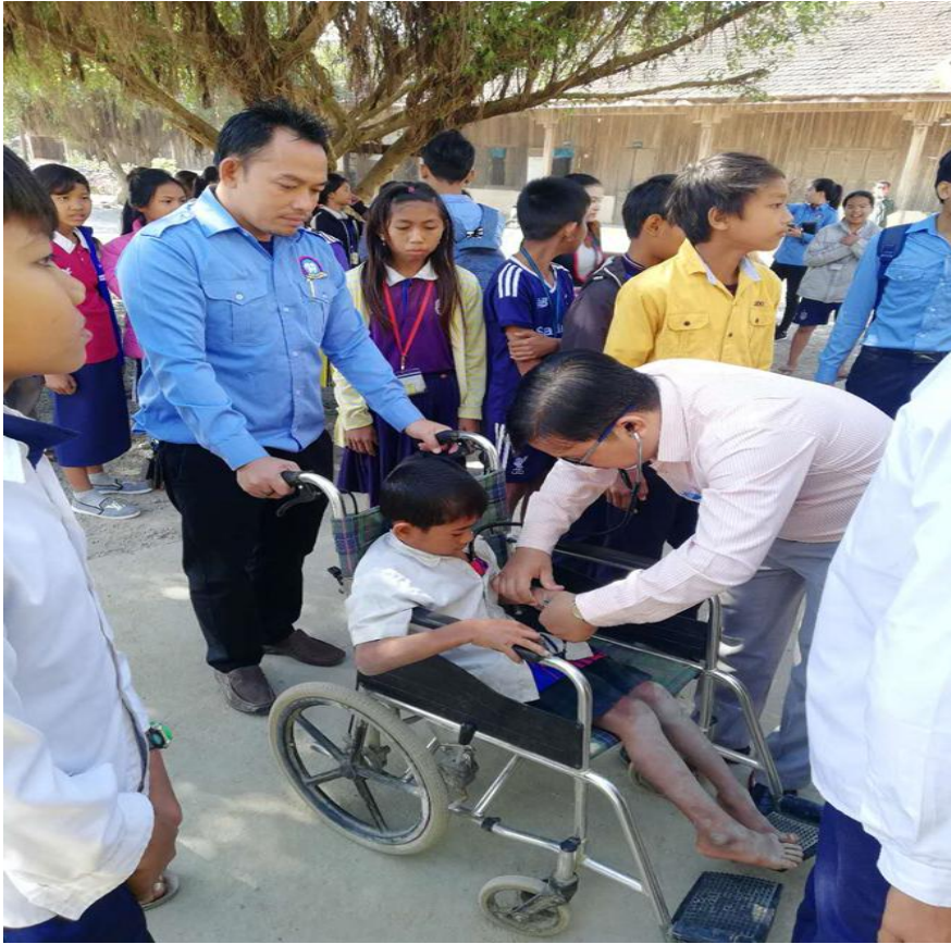
The volunteers helped Cambodia handicapped child for CHD screening.